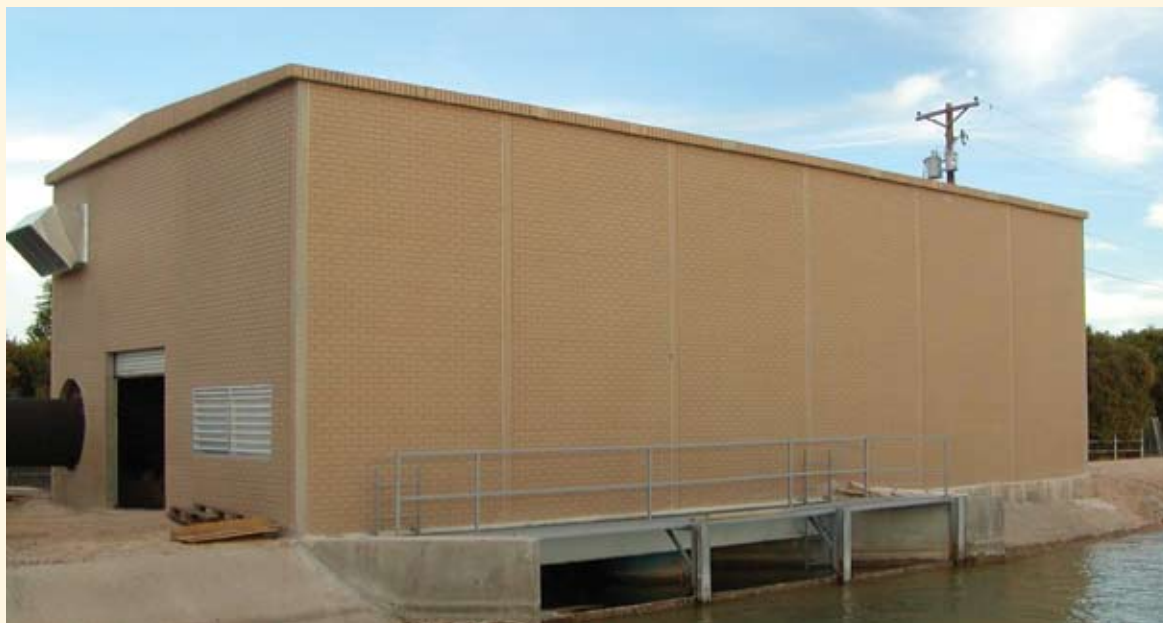
Unobstructed 30' W x 24' H x 60' L space allows room for large hydroturbine equipment, Mesa, AZ