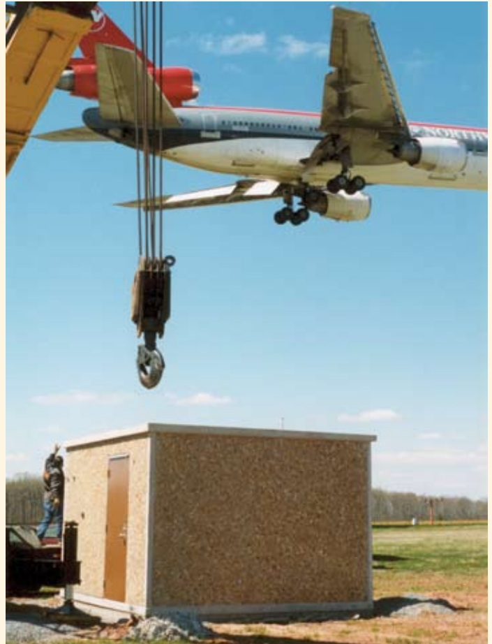
Quick installation of Navigational Aide Building at Dulles International Airport

Perimeter of floor is recessed so that the wall joint is below top of floor, which ensures additional watertight integrity.