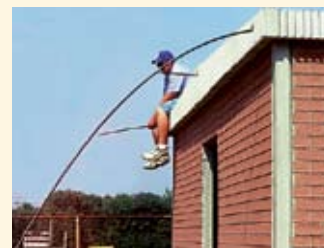
Additional sections can be attached to existing structure.

The engineering capabilities of EASI-SET® and its manufacturing network allow the design and production of bigger, more specialized buildings to meet your specific needs.