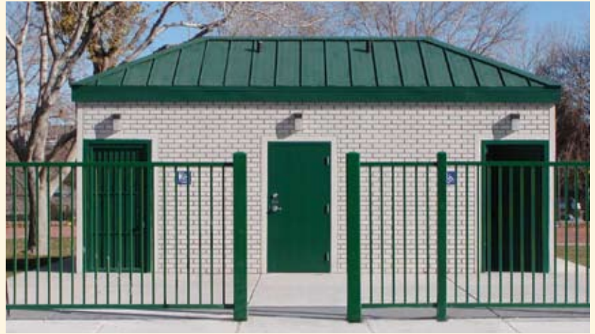
Restroom Building, Las Vegas, NV