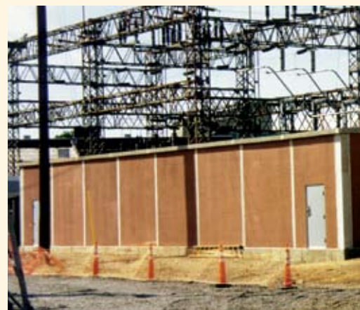
Electrical Substation, Board of Public Utilities