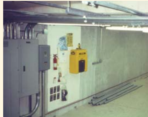
Unobstructed space allows room for large equipment Independent Hill, VA