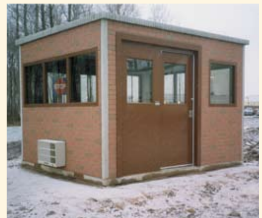
Federal Detention Facility Guardhouse, Batavia, NY