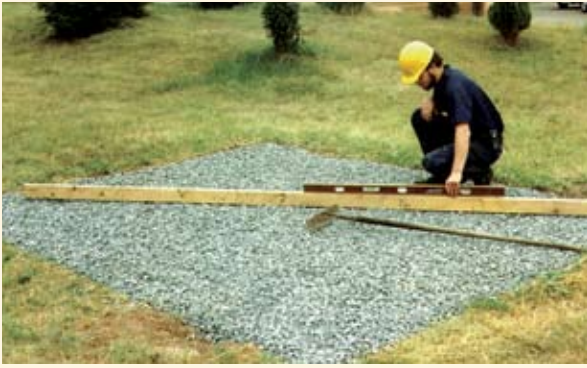
Simple site preparation, no footings required