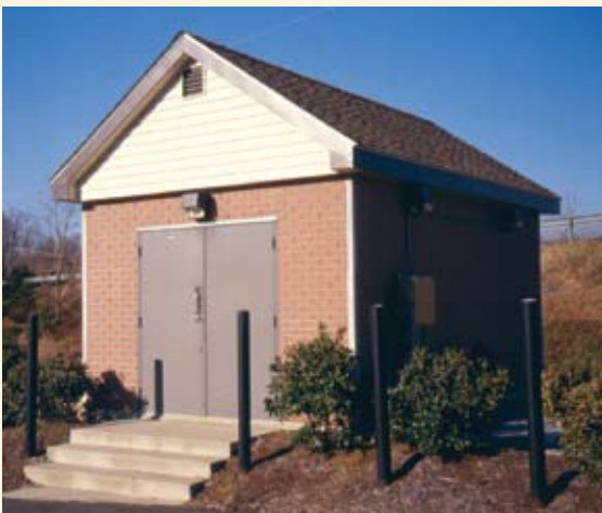
Generator Building, Oliver City Sanitary Sewer System, Warrenton, VA