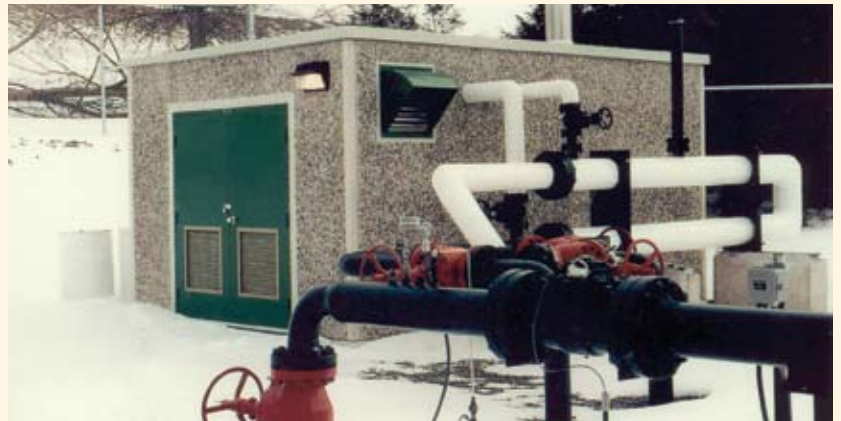
Pump Enclosure, Ontario, Canada