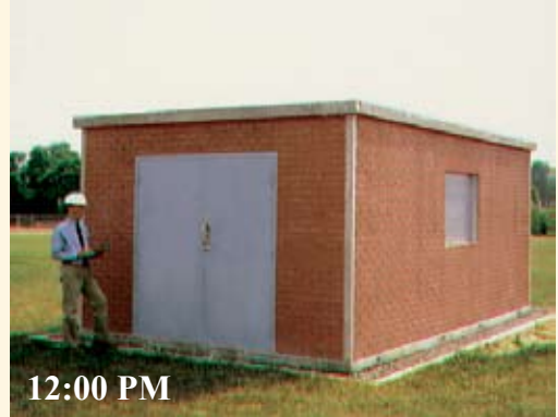
Installed in a matter of hours

The EASI-SET® / EASI-SPAN® Precast Building... Installed in hours for a "lifetime of protection"