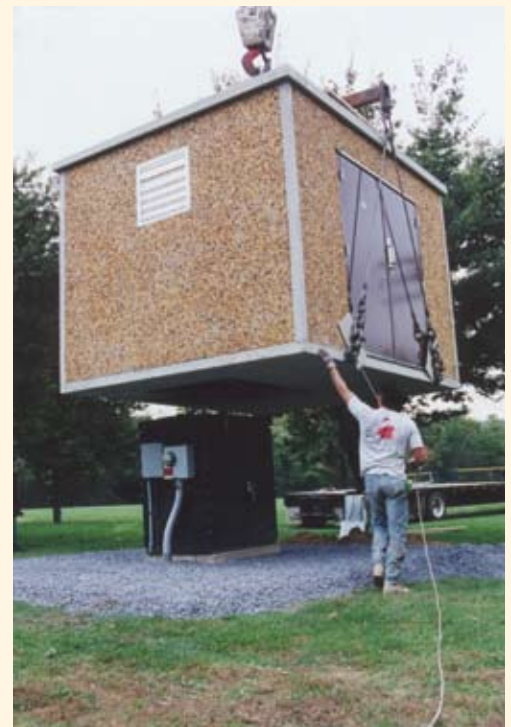
Transformer Substation (Pre-assembled building delivered with hole in floor to fit over transformer)

Contact your EASI-SET® Manufacturer for detailed specifications. Autocad specifications available on disk or via e-mail.