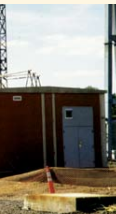
ies, Jamestown, NY