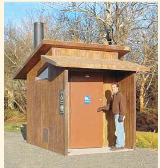
Outback Restroom Building, Midland, VA