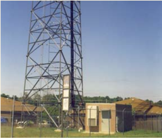
Communications Equipment Housing, Chicago, IL

EASI-SET® offers customers the largest selection of sizes, options and custom designs available in the industry.