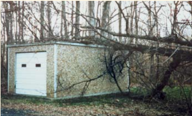
Fallen mature oak tree causes no damage