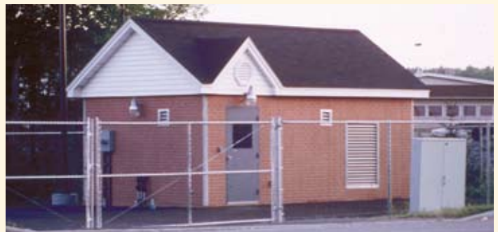
Walnut Creek pump station with optional roof detail, Lancaster, NY