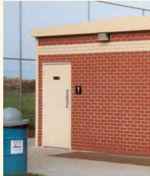
Combination concessions and restrooms

EASI-SET® provides the largest, precast concrete buildings.