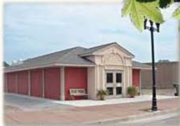
Deluxe restroom complex, Louisiana

Easy Site Preparation. Easy Delivery. Easy Installation. Easy Upkeep.