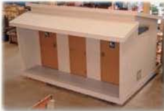
Factory built — for quality control and no on-site delays