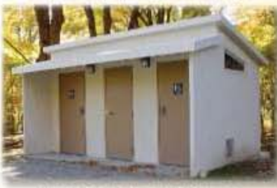
Installed — Outback: Sierra® Model, Connecticut