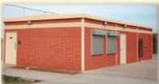
Restroom, concession stand, and storage, Wisconsin

Additional finishes are available. Colors and textures of natural materials may vary by region.