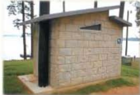
Outback: Blue Ridge® Model showing FAN® vent stack, Alabama

Outbacks are supplied in a variety of finishes, pre-plumbed, pre-wired, air-conditioned and/or with our exclusive FAN® ventilation technology. Standard models are equipped with underground precast concrete containment vaults, where required.