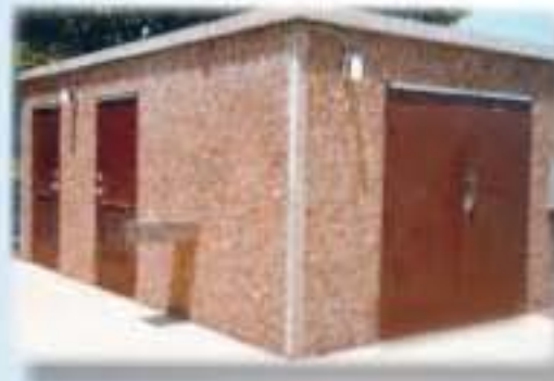
Traditional flat roof restroom and storage building, Maryland

Top Photo: Blue Ridge® Model, Virginia Middle Photo: Sierra® Model being set Bottom Photo: Dual Restroom with Chase, Pennsylvania