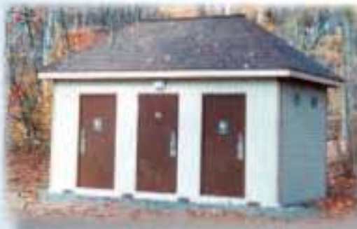
Traditional restroom with hip roof, Pennsylvania