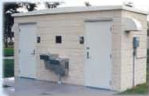
Traditional restroom with sloped roof & blue doors, Minnesota