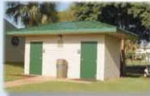
Traditional restroom with added metal roof, Florida