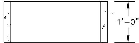
OPTIONAL 12" RISER